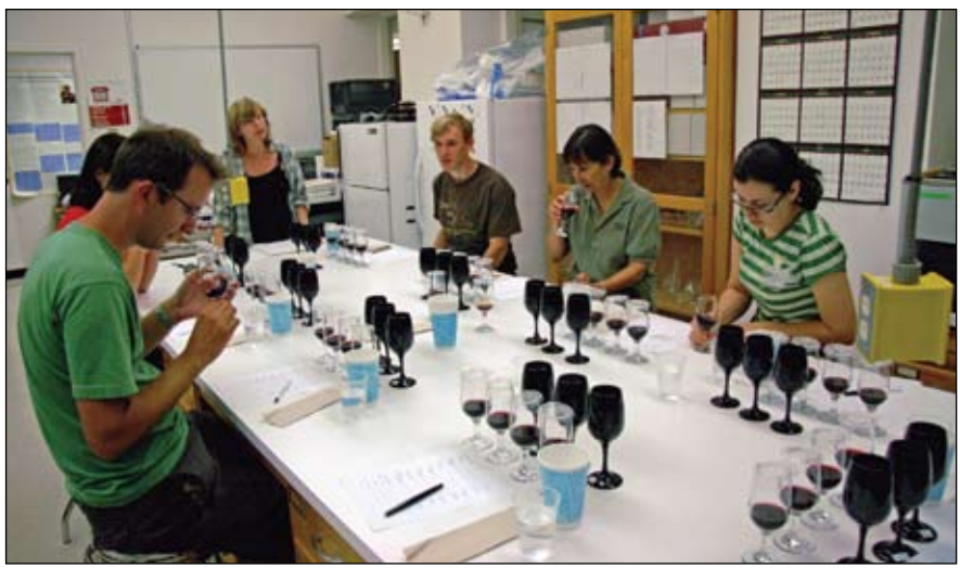
A tasting panel at UC Davis learns how to identify differences in wine. Analytical sensory studies will be moved from Wickson Hall to sophisticated new facilities in 2008.

genome plays out in human metabolism. He sees vast potential in emerging technologies that will provide more detailed health information coupled with new food products.