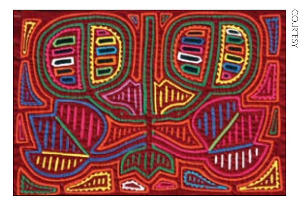
This hand-sewn mola made by Kuna Indians depicts cacao pods full of seeds.

Why chocolate? "It turns out that cocoa, if it's properly processed, has one of the highest concentrations of flavonoids in foods that are routinely consumed by people," says Keen. In a raw state, the beans that grow inside the pods on the cacao tree are extremely high in flavanols, a type of flavonoid. They're also bitter and virtually inedible, and require extensive processing to become the chocolate products